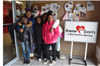
Volunteering at the Humane Society