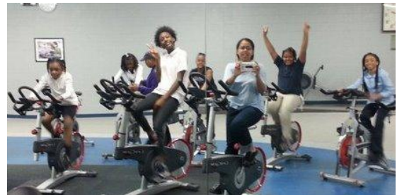
Health classes at the YMCA