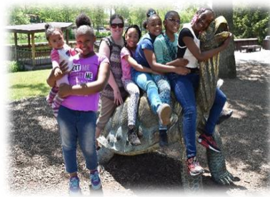
Visiting Pottawatomie Zoo

I am truly happy to be part of the BHGA family.