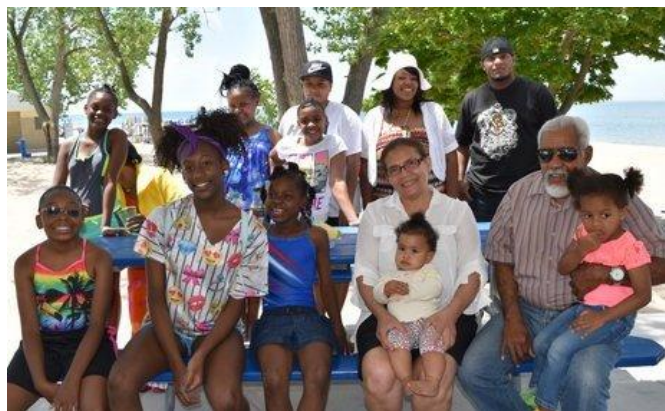
Benton Harbor Girls Academy Families at our picnic

NONPROFIT ORG. U.S. POSTAGE PAID BENTON HARBOR, MI 49022 PERMIT NO. 3