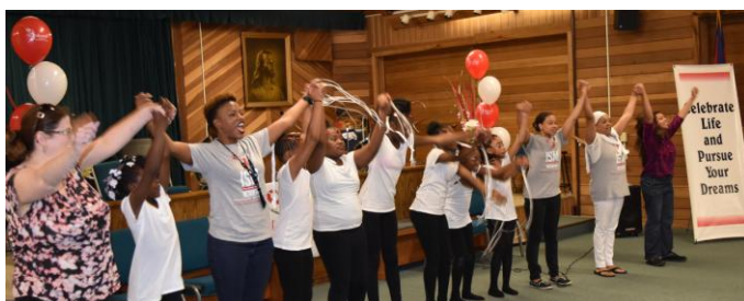
I'm Saving Myself musical performance