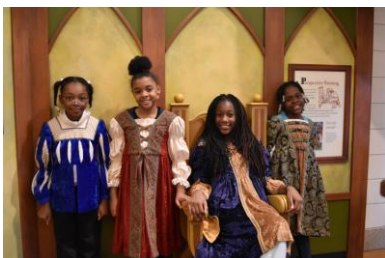
Our Spanish Play – at the Spanish Court